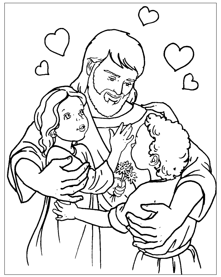
Jesus is reason alone to praise God.

The fact that God sent His one and only Son to pay for the sins of the world is reason enough to praise Him, but there are many other reasons for praising God. This lesson will teach you some of the other reasons why you should thank and praise God.