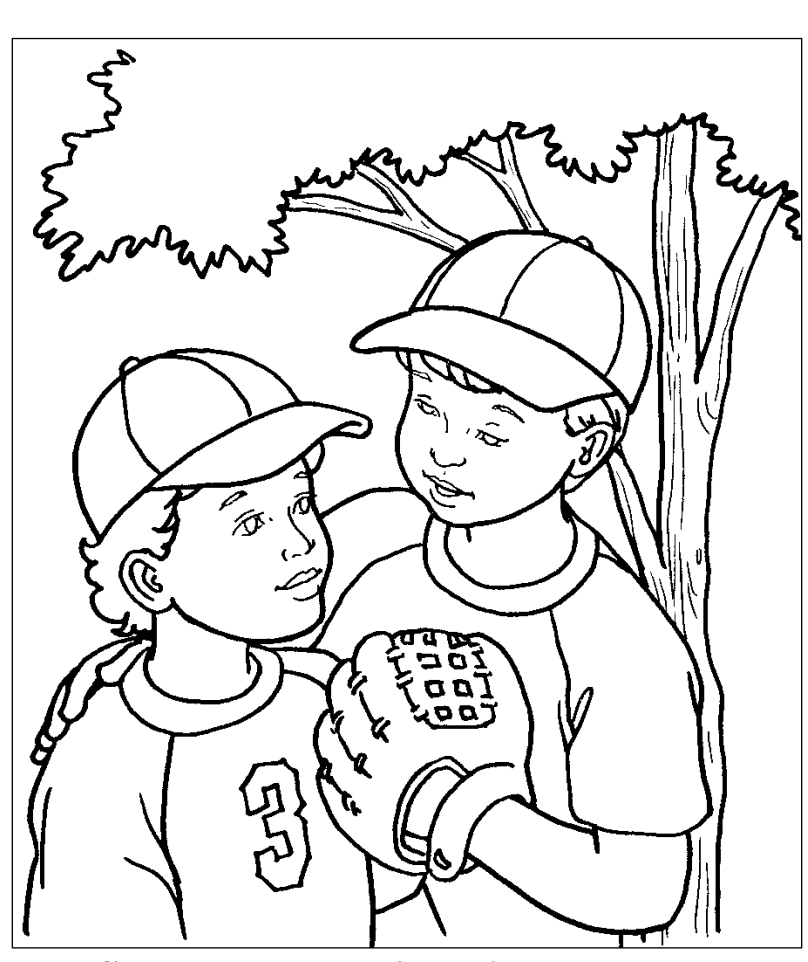
Say only what will build up others.

build Forgive anger Holy Spirit mouth 3. You should not let any evil talk come out of your ______. You should say only what will help to ______ others up and meet 4. their needs. 5. When you speak unkindly about others, you make God's ______ _____ sad. 6. You should get rid of all hard feelings, ______ and rage. 7. _____ others just as God has forgiven you because of what Christ has done.