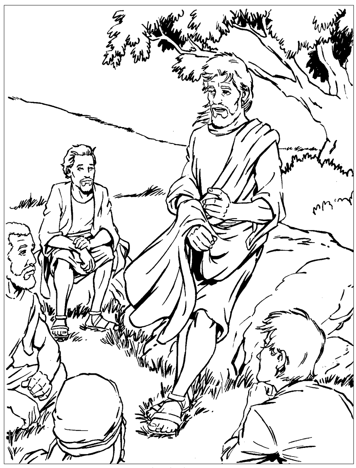
Jesus tells His disciples to cheer up.